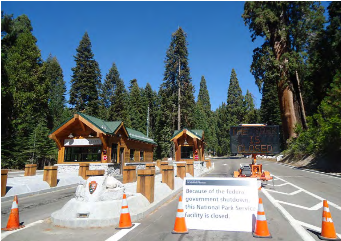
The newly constructed Kings Canyon National Park Entrance Station during the October 2013 Federal Government Shutdown

Estimates from the most currently available annual NPS Visitor Spending Effects report for the year 2012 (Cullinane Thomas et al., 2014) were used to analyze changes in local and non-local visitor spending. Spending averages covered all trip expenses within roughly 60 miles of the park; these averages excluded most en-route expenses on longer trips, airfares, and purchases made at home in preparation for the trip including durable goods and equipment. Spending averages vary from park to park based on the type of park. The Consumer Price Index inflation calculator (Bureau of Labor Statistics, 2013) was used to adjust the 2012 spending estimates to 2013 dollars.