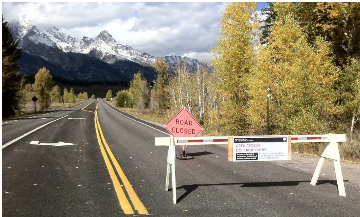
Teton Park Road just south of the Moose Entrance Station during the October 2013 Federal Government Shutdown

Note - Excludes Parkways and National Memorials due to varying access issues during the shutdown. Castle Clinton was closed in October 2012 due to Hurricane Sandy which had a downward effect on the overall three year average visitation estimate.